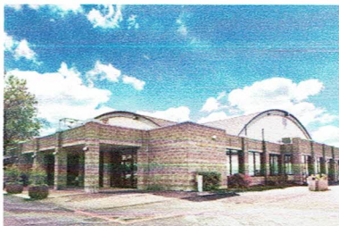
EVENT VENUE—OREGON STATE FAIRGROUNDS CASCADE HALL—2330 17TH STREET NE SALEM, OREGON 97301

7:00 – 8:30 am Entry & Registration 9:00 am Stewards and judges review classes 9:30 am Judges introduced 9:45 am Judging begins Admissions & Salesroom opens Noon – Lunch break 12:30- 1:15 pm Raffle 1:15 pm – 3:00 pm Judging continues 3:30 pm Awards presentation 4:00 pm Salesroom Closes & Check Out 4:30-6:30 pm Take Down & Clean Up Show Hall 7:00pm Dinner with judges